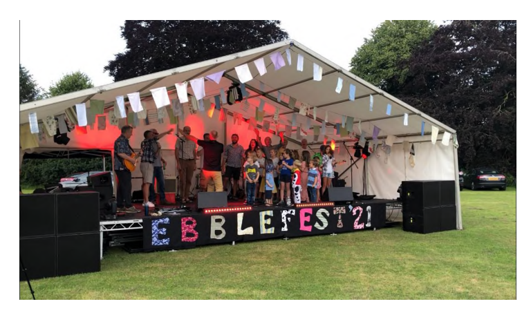
Community singing with Badger Blues