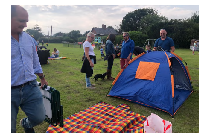
Radio Odstock broadcast live from Nunton