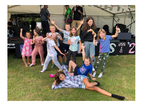
The next generation