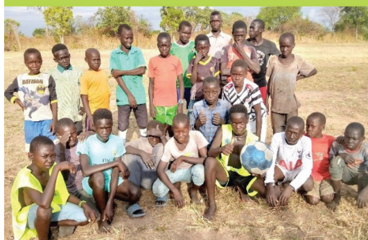
Football given to CATT participants